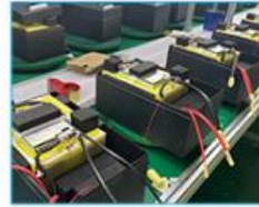
Connect BMS Main Board