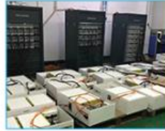
Aging and QC Testing