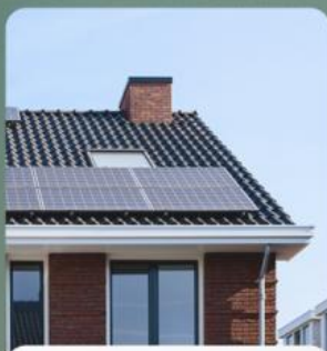
01 FOR Home use