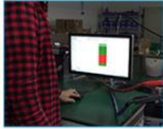
Parameter and Performance Testing