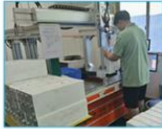
Battery Cell Testing and Matching