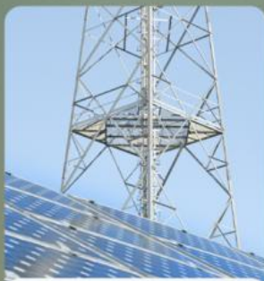
03 FOR Base Station