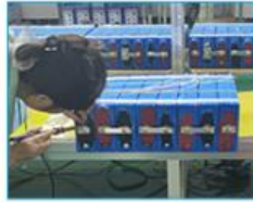
Assembling Battery Pack