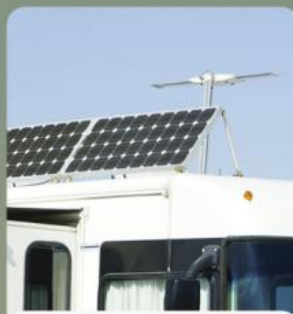
04 FOR RV