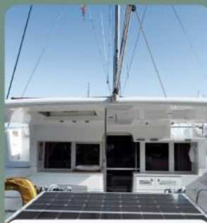
02 FOR Yacht