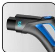
Other charging equipment